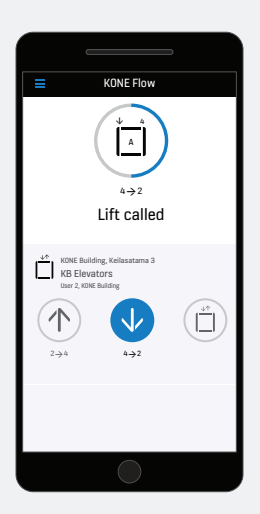
Elevator call is processed