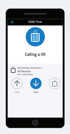
User calls the elevator