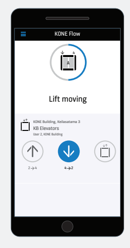
Elevator journey begins