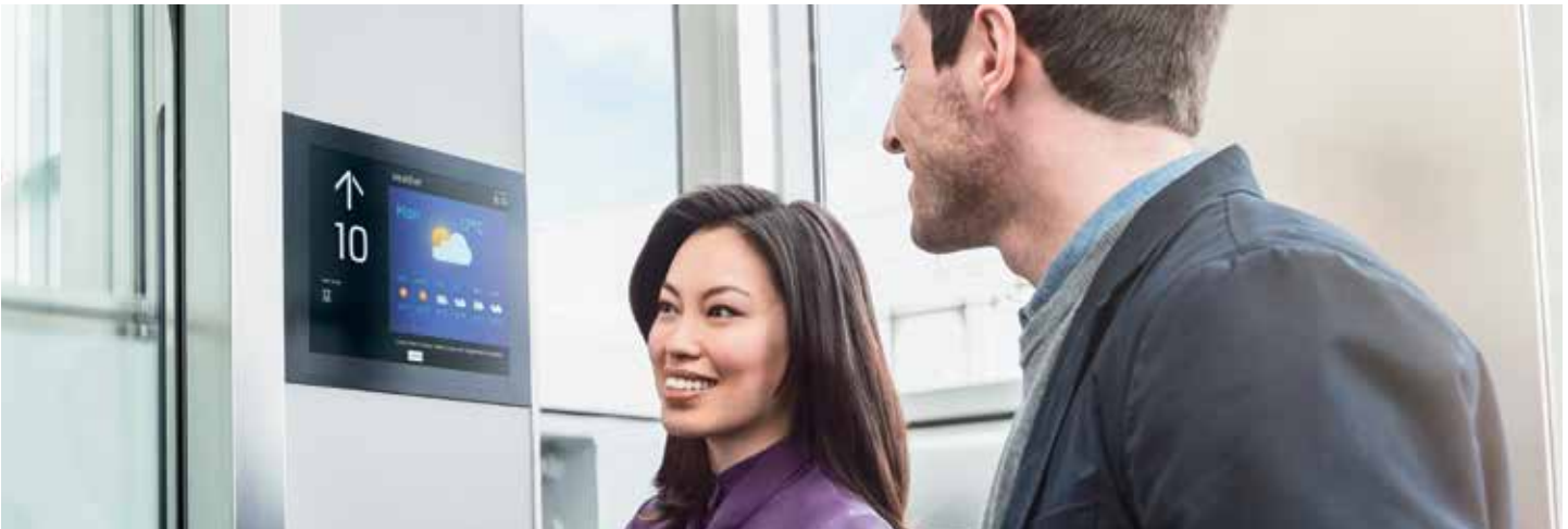
The KONE InfoScreen is an open channel of communication between you and elevator passengers.

* Online version is only available for KONE MonoSpace 700 and KONE MiniSpace.