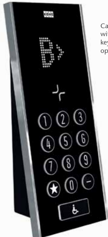
Card reader integrated with KONE Polaris keypad destination operating panel

NOTE: KONE Access supports both MIFARE® and HID™ card reader types. For additional card reader types supported by KONE Access, please contact your KONE Sales Professional for details.