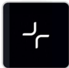
MIFARE® card reader (surface-mounted KONE Registration Unit shown)