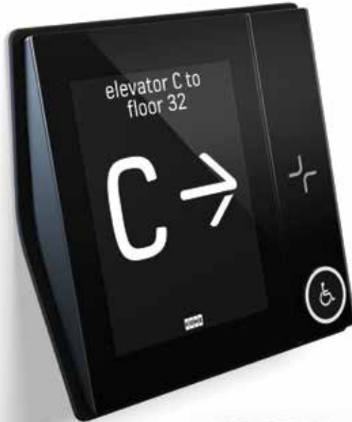
Card reader integrated with KONE Polaris™ touchscreen destination operating panel