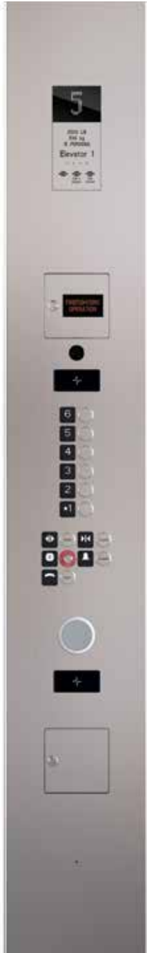
Card reader integrated with KSS 570 car operating panel

Our user-friendly, integrated access and destination solutions are designed to make it easy for people to move throughout your building.